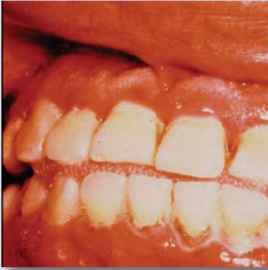
Periodontal (gum) disease