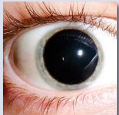
An irregular pupil can be a sign of iritis or nerve palsy—a potential complication of diabetes or other conditions. Iritis can lead to pupillary block glaucoma, a sight-threatening condition. This patient needs a referral.