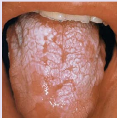
Thrush (oral candidiasis)