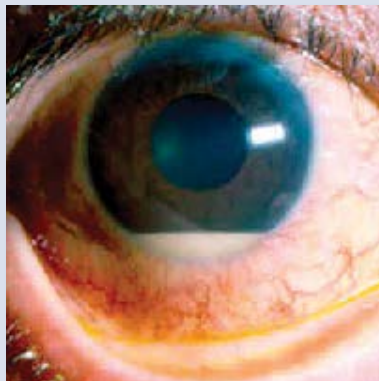
Hypopyon, white cells collecting in the anterior chamber of the eye, is a sign of serious intraocular infection and/or inflammation; this person should be referred immediately.