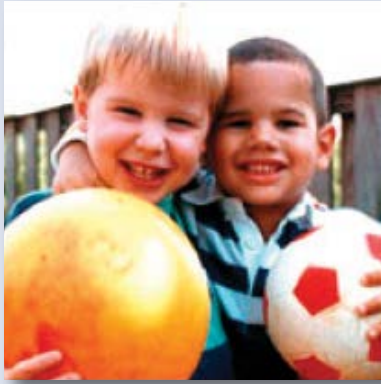
This is what a person with normal vision sees.