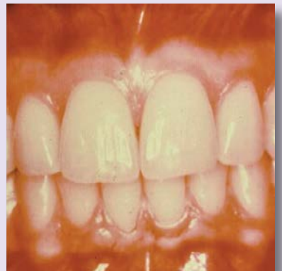
Healthy gums and teeth