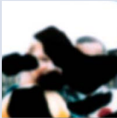
This is what a person with diabetic retinopathy sees.