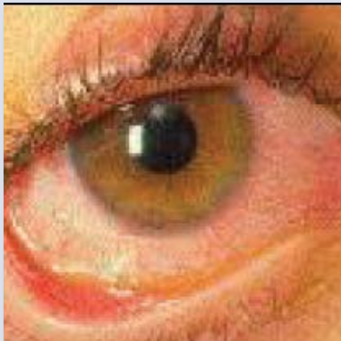
This patient with eye pain, light sensitivity, and a 2-mm white lesion has a corneal ulcer. People with diabetes may not complain of pain because of corneal neuropathy. Steroid or over-the-counter eye drops would be a serious mistake—this patient needs a referral.