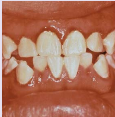
Periodontal (gum) disease